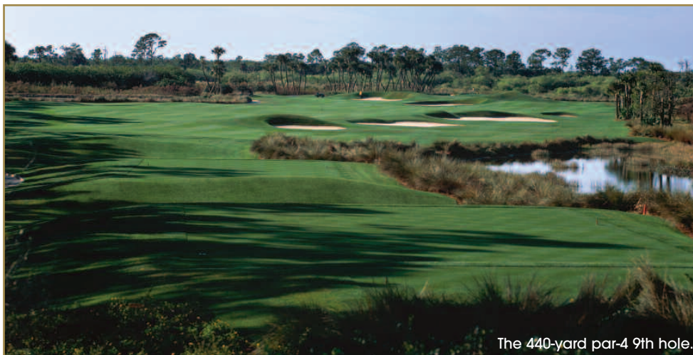
The 440-yard par-4 9th hole.

Fiddler's Creek epitomizes the master-planned upscale golf community. This private club has a limited number of memberships currently available.