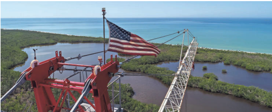
ABOVE: Mystique is a 20-story tower underway in Pelican Bay. LEFT: The 20-story tower of Mystique in Pelican Bay is approximately 95% made in the USA.

Ritz-Carlton, Naples and Port Royal. Mystique offers 68 estate and four penthouse residences with expansive living spaces and terrace views toward the Gulf of Mexico from most units. Additionally, Mystique offers nine Jardin residences. Mystique’s building amenities include a 24-hour staffed front desk with a monitored video/electronic closed circuit surveillance system, surveillance cameras at all owner entry accesses, and a two-level parking garage with controlled access. Additionally, Mystique offers SmartEstate integrated technology that features state-of-the-art home automation and monitoring systems, private elevators with biometric/